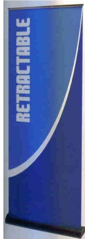
Retractable banner with stand

A receipt from the printer (New Vision-Naperville, IL) indicating full amount charged on listed credit card will be mailed with the banner. Sales tax rate is 3.625%.